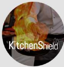
WCK kitchen fire suppression system