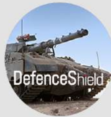
Total protection for military vehicle