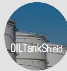
Advanced oil storage tank fire protection system