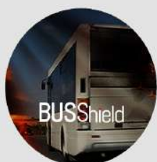
Advanced Bus fire protection system

Lehavot's global presence provides customers with real peace of mind. With a worldwide network of subsidiaries and international distributors, the company's reputation has been established through a commitment to top quality sales & post sales service supported by teams of highly trained & dedicated professionals.